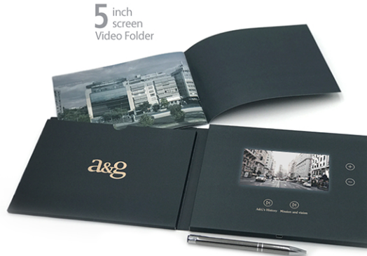
5 inch screen Video Folder