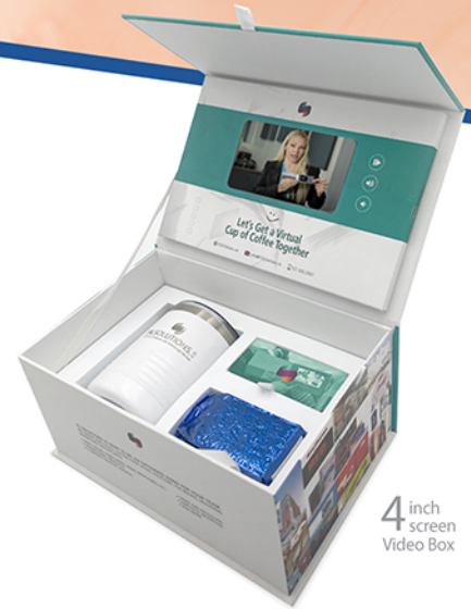
4 inch screen Video Box

*Final prices are based on variables, for exact pricing contact your rep at FL Solutions