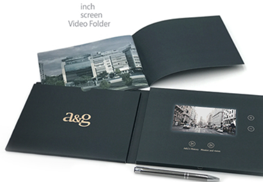
4 inch screen Video Folder