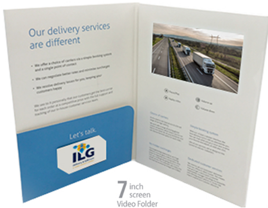
7 inch screen Video Folder